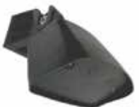
Motion Sensor Triggers Sign Projector