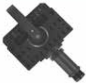
ECO Spot B150PCE Sign Projector

Rugged / Cold / Hot / Humid Conditions High Traffic / Risk Areas Low-Light Environments Moving Equipment Locations where Paint and Tape are Impractical