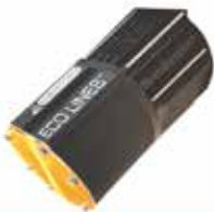
ECO Lines EL-80 Line Projector